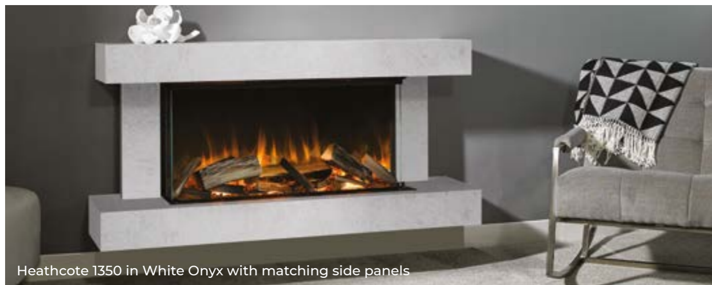
Heathcote 1350 in White Onyx with matching side panels