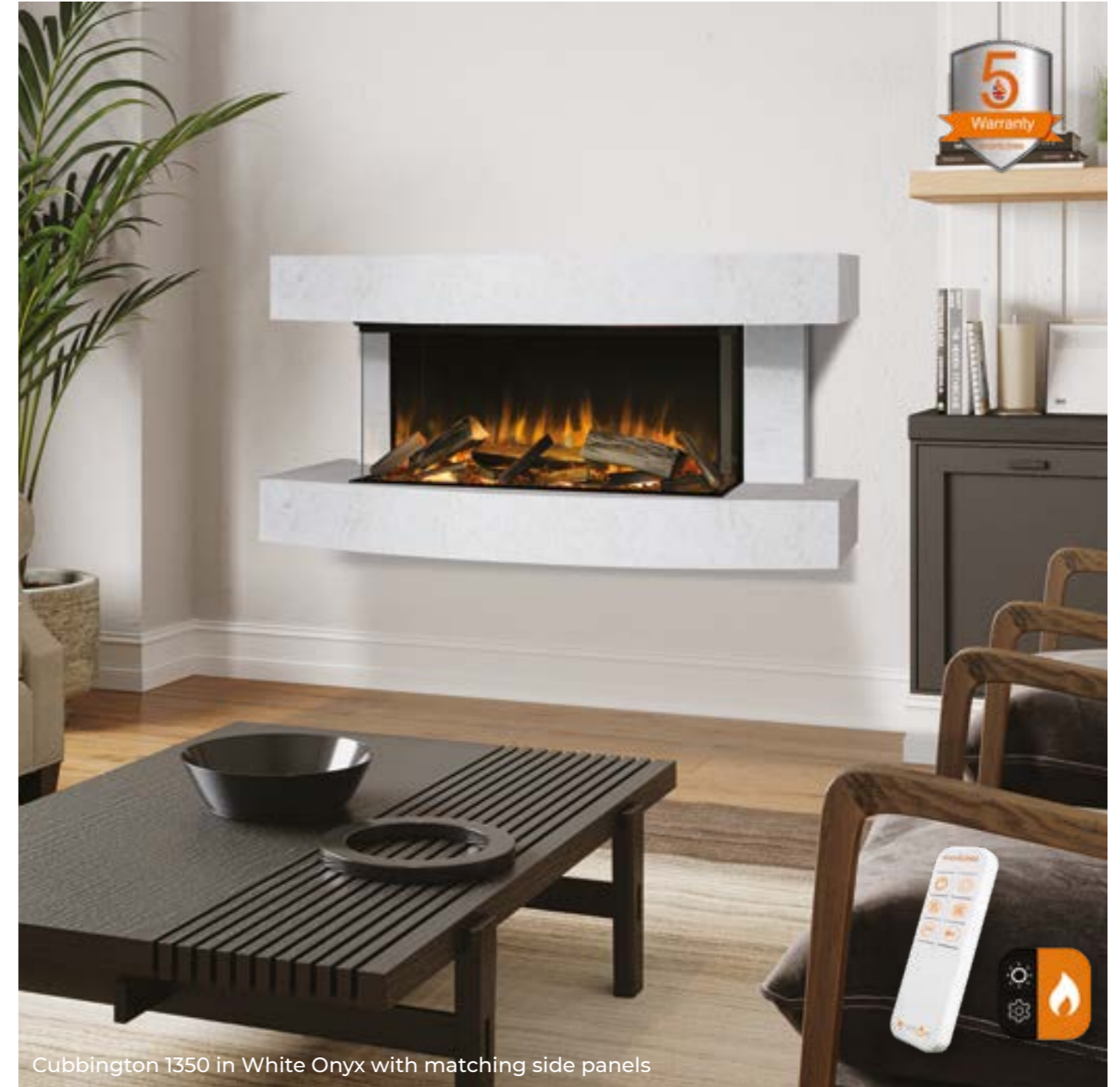
Cubbington 1350 in White Onyx with matching side panels