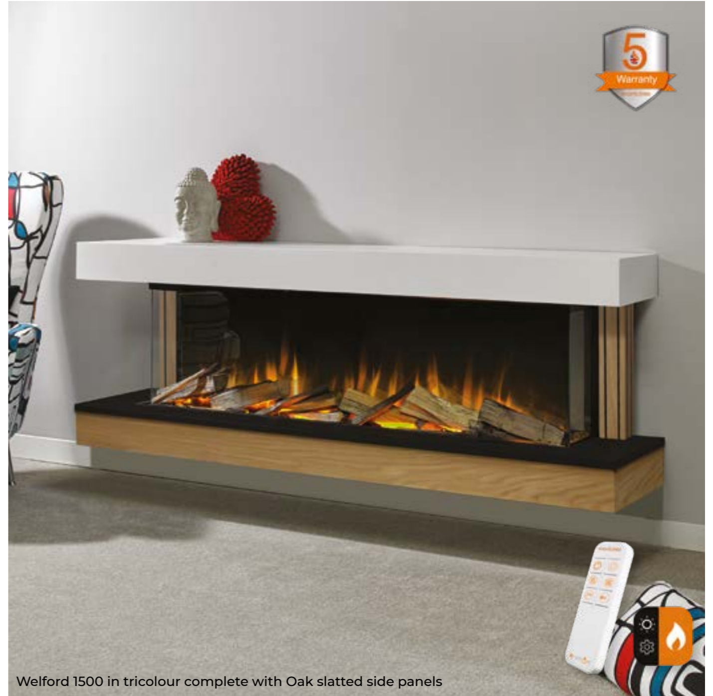
Welford 1500 in tricolour complete with Oak slatted side panels