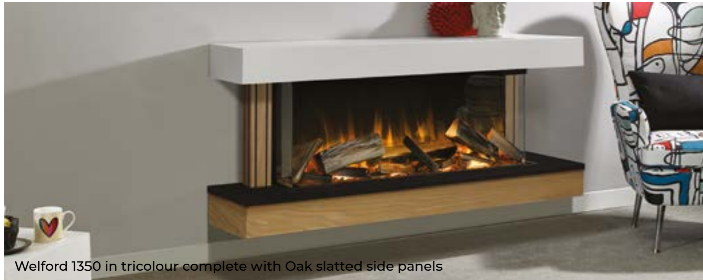
Welford 1350 in tricolour complete with Oak slatted side panels