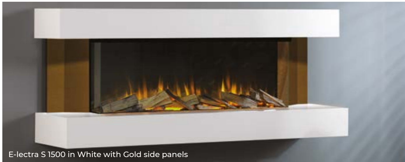
E-lectra S 1500 in White with Gold side panels