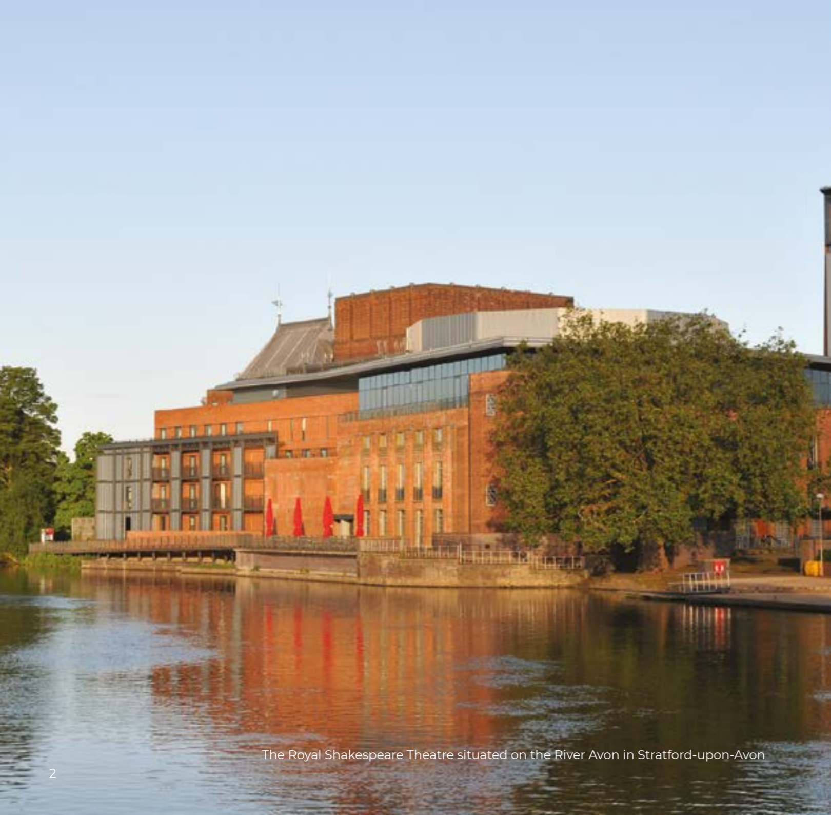
The Royal Shakespeare Theatre situated on the River Avon in Stratford-upon-Avon