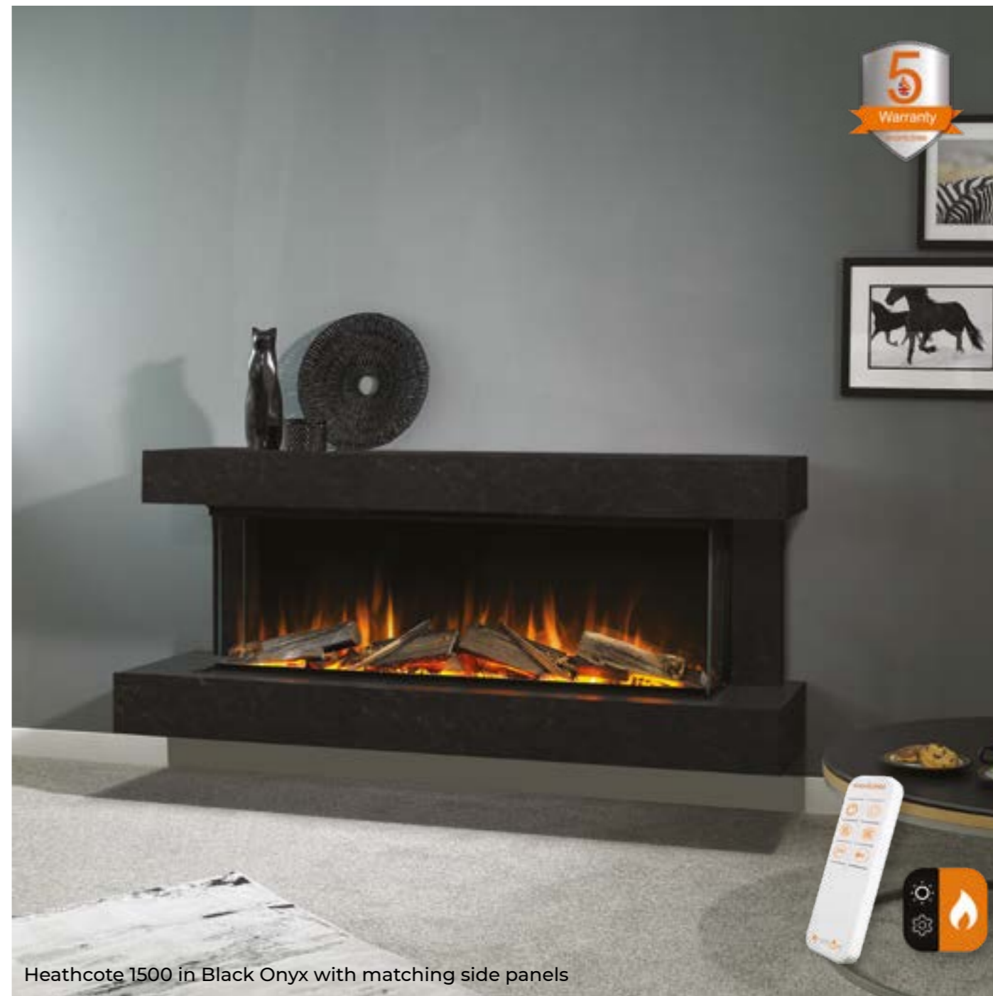
Heathcote 1500 in Black Onyx with matching side panels