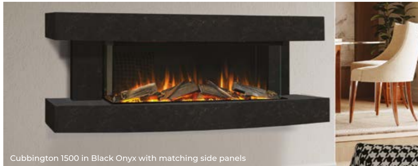
Cubbington 1500 in Black Onyx with matching side panels