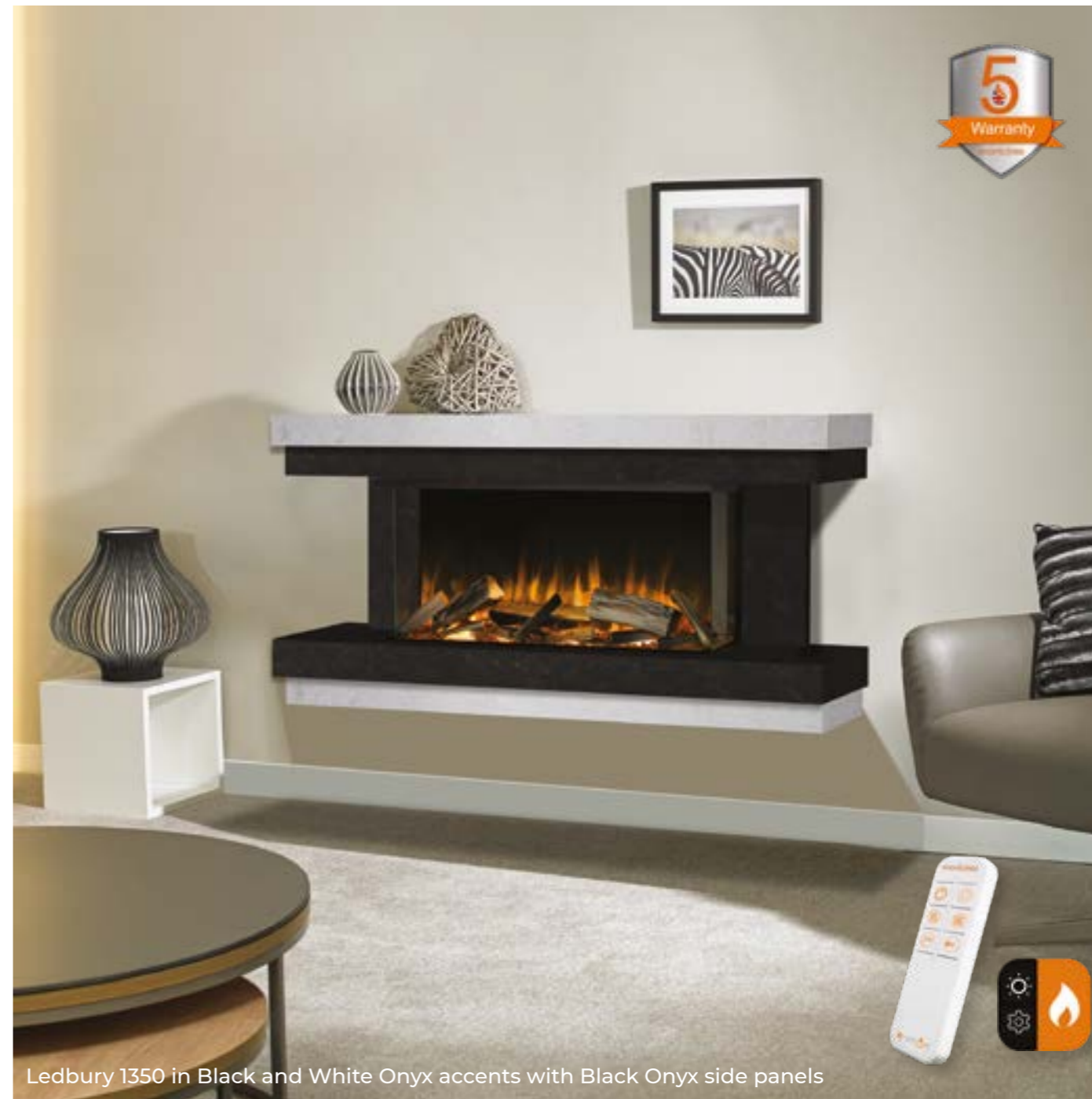
Ledbury 1350 in Black and White Onyx accents with Black Onyx side panels