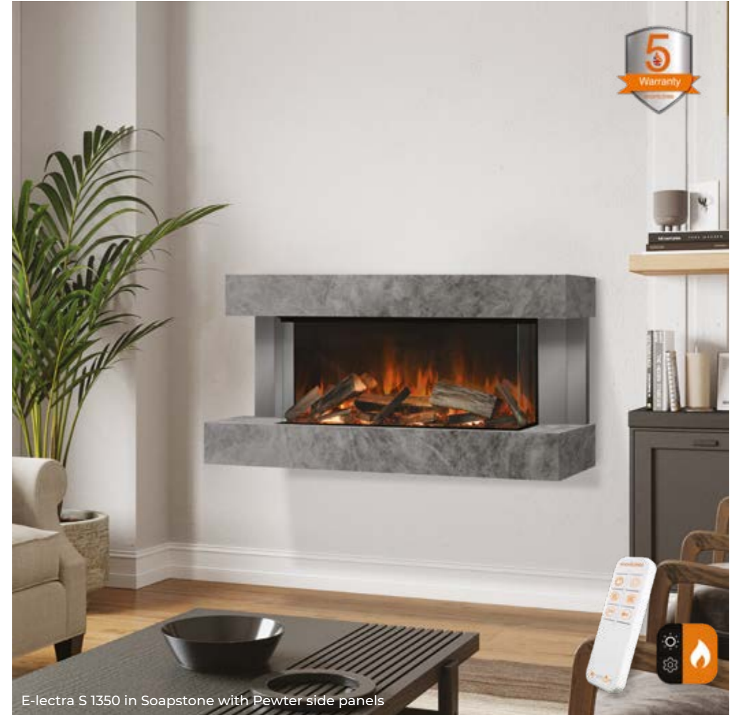
E-lectra S 1350 in Soapstone with Pewter side panels