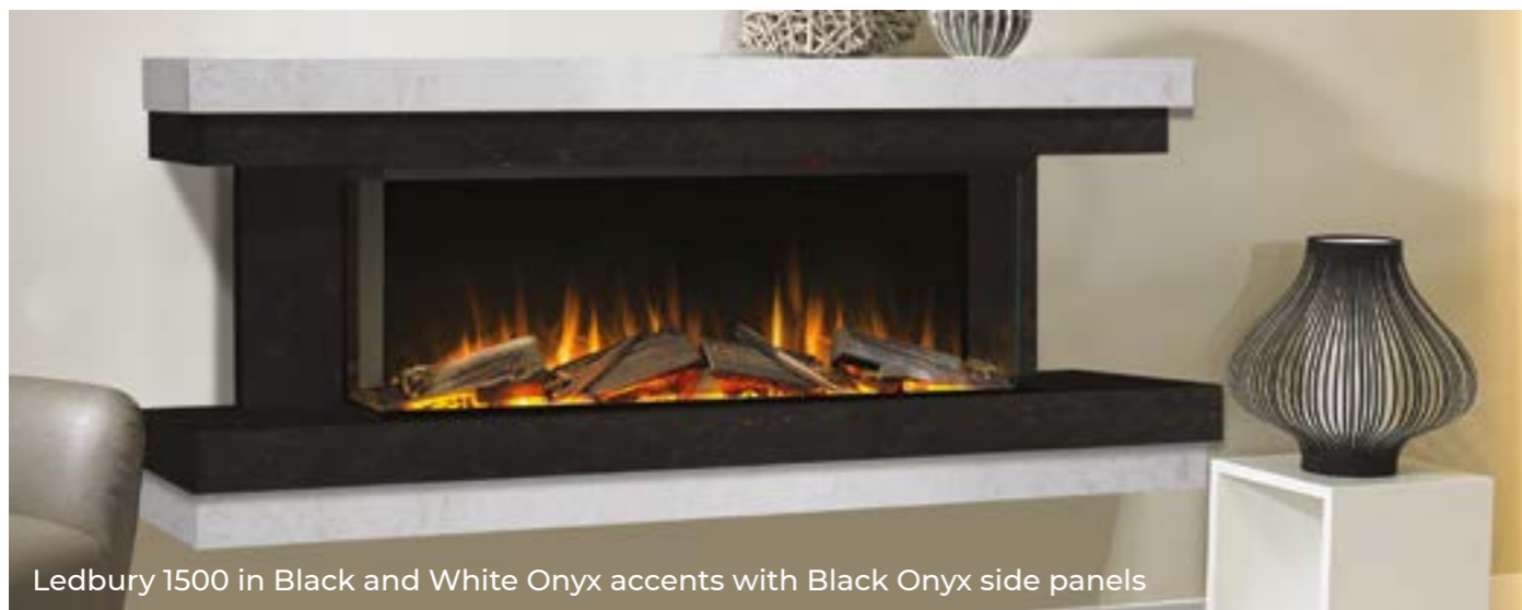
Ledbury 1500 in Black and White Onyx accents with Black Onyx side panels